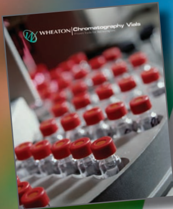
See our new Chromatography Vial Brochure, Lit. No. 8267